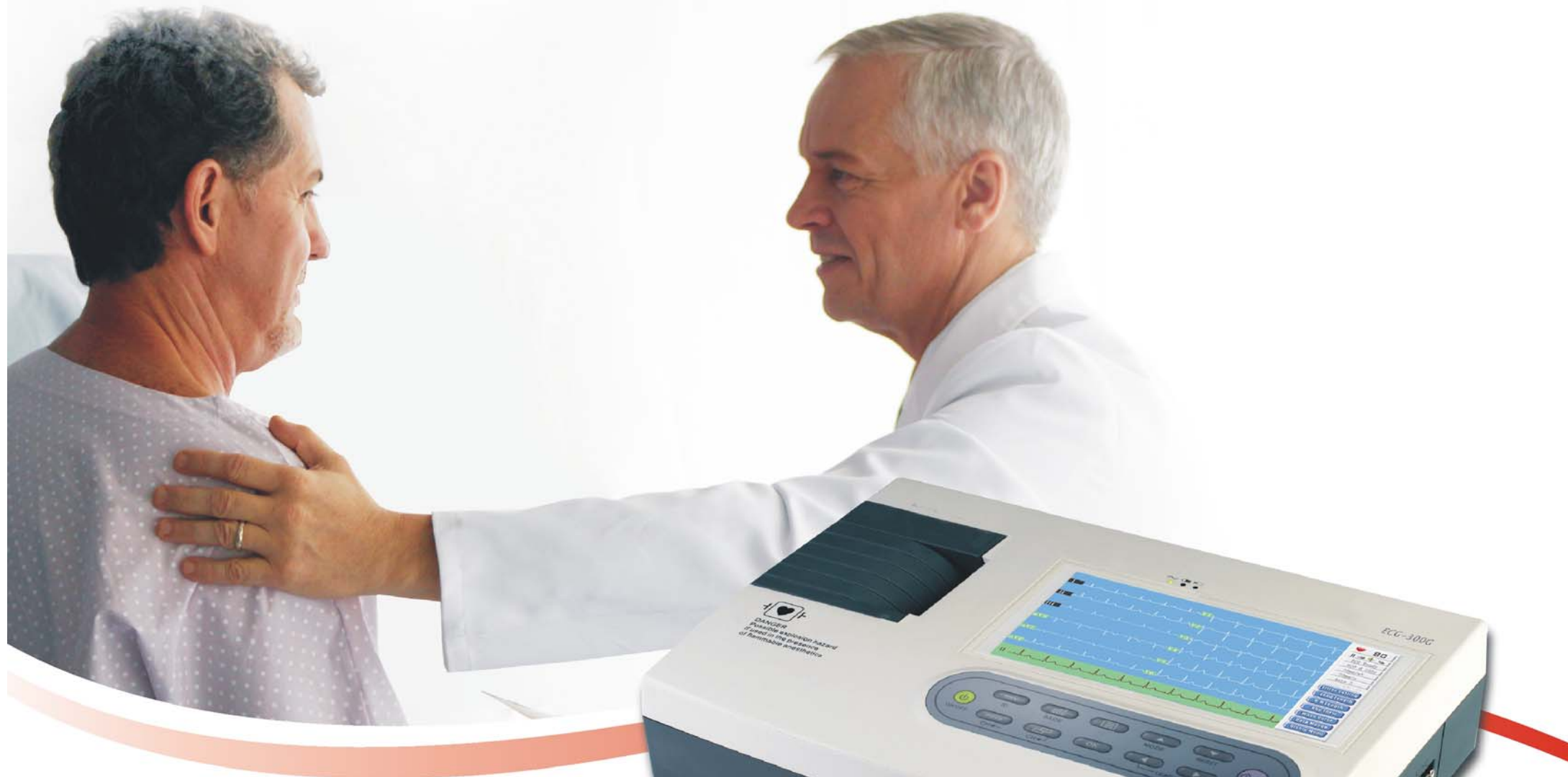
ECG-300G (Color Display) Digital 3-channel ECG