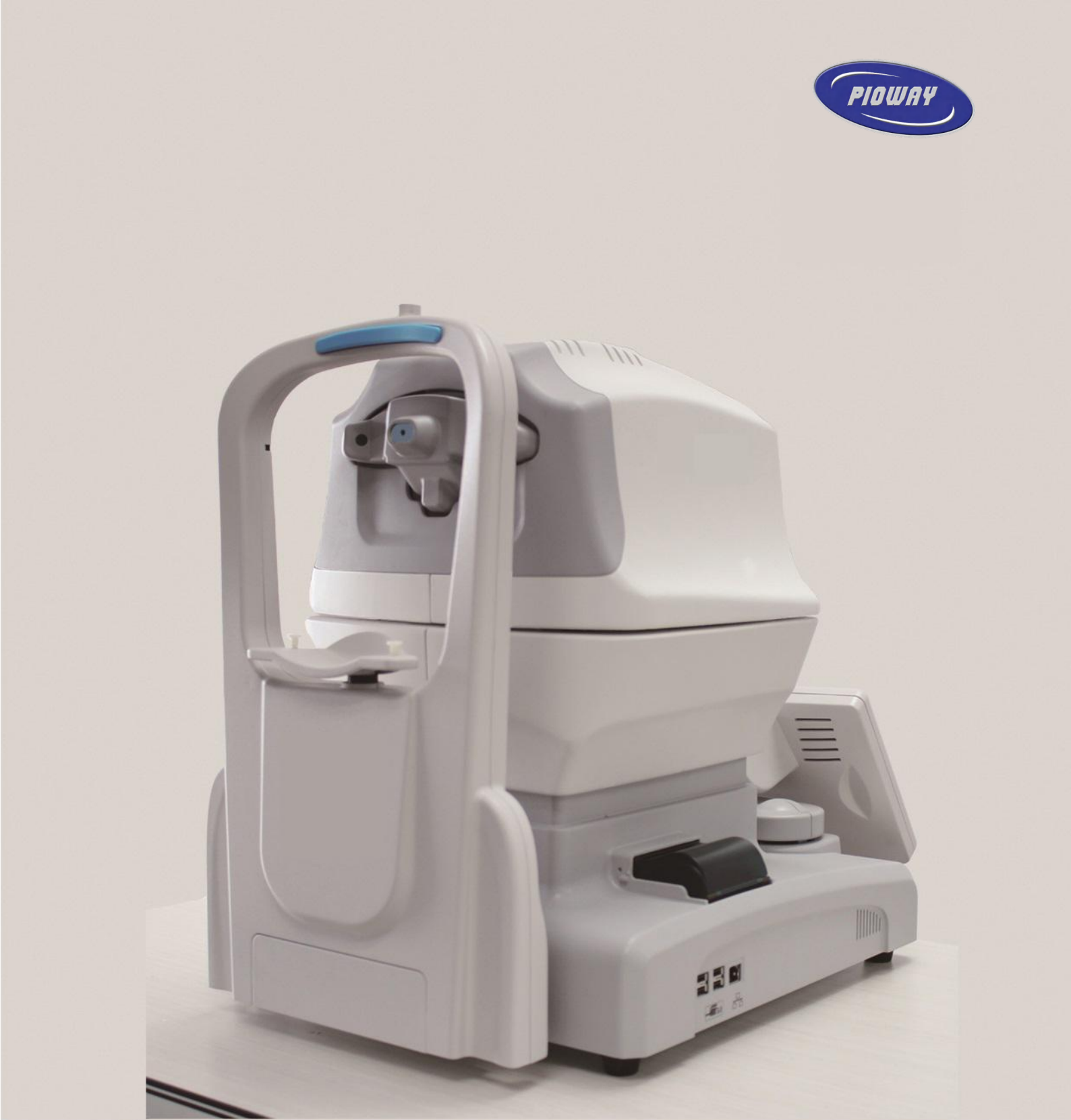
ST-1000 ST-1000P Full Auto Non-contact Tonometer